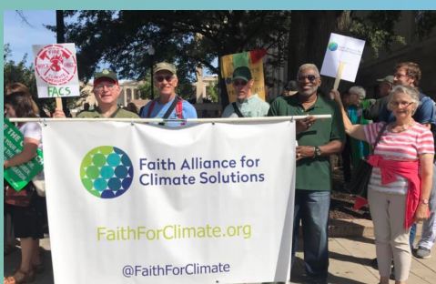
FACS members at the Youth Climate Strike in DC.

Building personal relationships with our District Supervisors is at the heart of FACS, success.